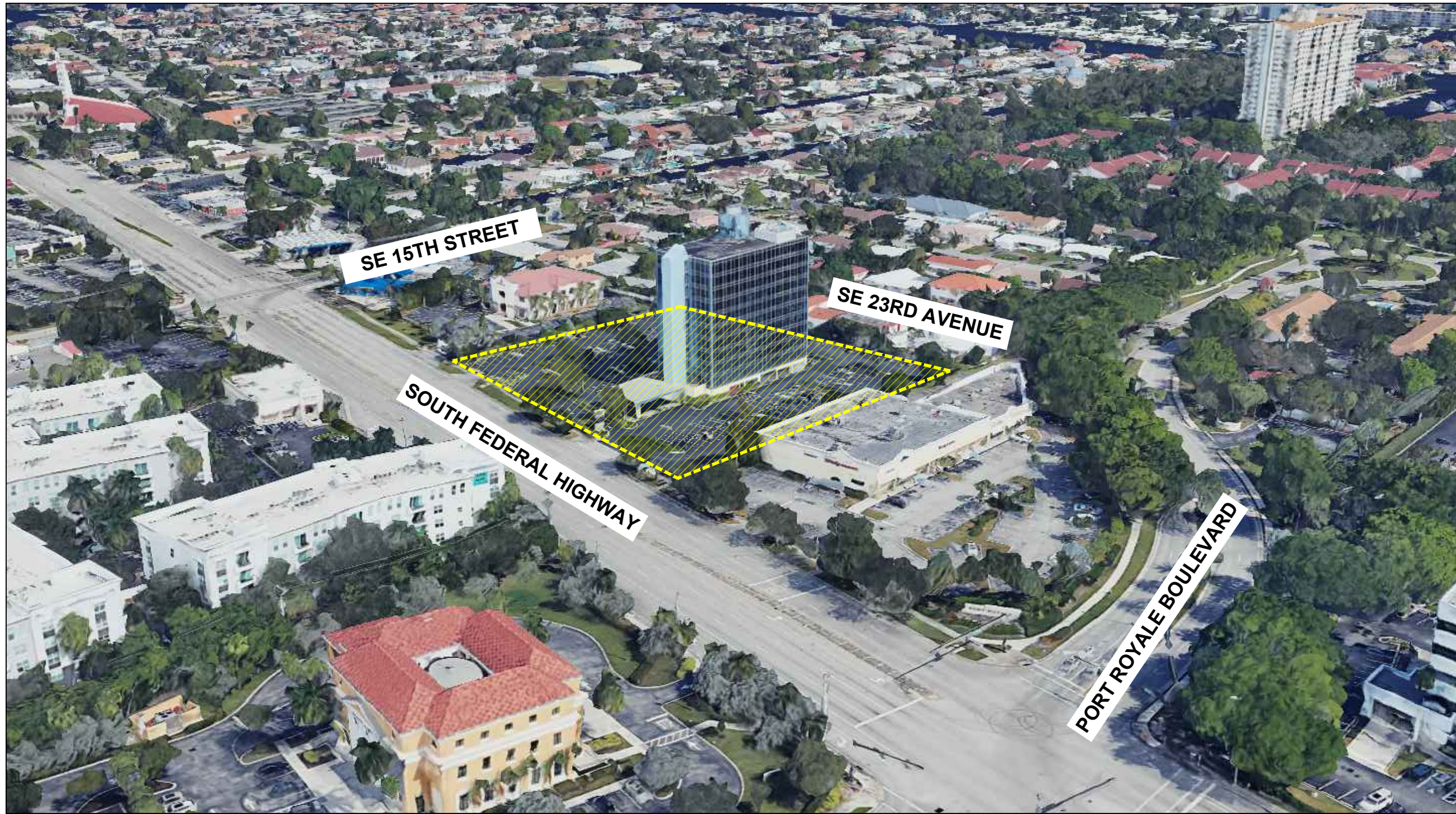
3D AERIAL VIEW - 1 (LOOKING NORTH - EAST)